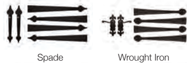
Spade Wrought Iron