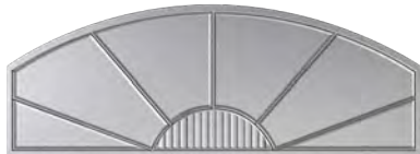
Long Arched Monticello

Somerset and Monticello shown in platinum leading and are also available with brass leading.