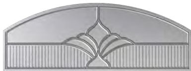
Long Arched Somerset